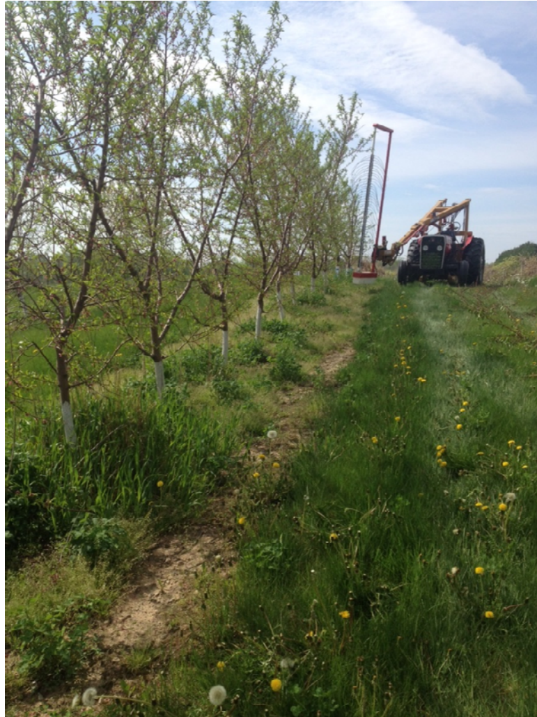
Palmette at 10 ft spacing